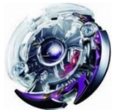
(FIG 2) DOOMSCISOR D2