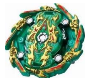
(FIG 14) ASHINDRA

There are several small recoil points which means that nearly every time you hit an enemy blade you are going to be taking recoil damage. Check out the recoil points all over the outer ridge on Betromoth . That means high recoil regularly, which is not something that you really want. Also, the points are significantly shorter so you're not as likely to be dealing the damage you're looking for in an attack style combination.