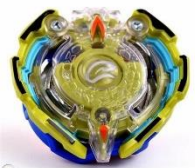
(FIG 9) QUETZIKO

[2] Elliptical beyblades : They're quite a bit longer than the circular types and they will have some shorter and flatter sides along the points. This attack type, Digger (see fig. 4), has these long attack prongs at the apexes that are going to be used for maximum damage. As an attack type, those hook ends are going to be slamming away at the enemy blade. Contrary to the Glyph Pegasus (see fig, 5), that is a more stamina type of an oval shape and it's more about trying to buffer away enemy attacks with less recoil. Elliptical beyblades are one of the best styles to use for attack types, as their long sides provide great damage points. But the smooth outer edges provide less recoil in the rest of the combination compared to other shapes.