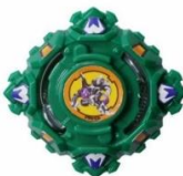
(FIG 7) DRACIEL