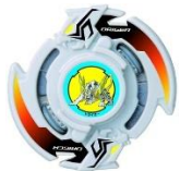
(FIG 4) DRIGGER