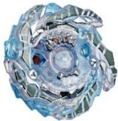
(FIG 11) BETROMOTH