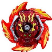
(FIG 12) ERASE BALKESH