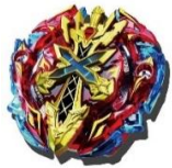
(FIG 10) XCALIUS