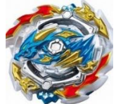
(FIG 3) ACE DRAGON