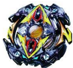
(FIG 13) ZEUTRON