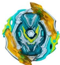
(FIG 8) UNION VALTRYEK