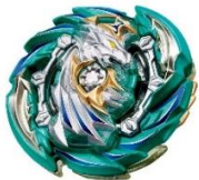
(FIG 5) GLYPH PEGASUS