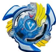
(FIG 6) VALTRYEK V2